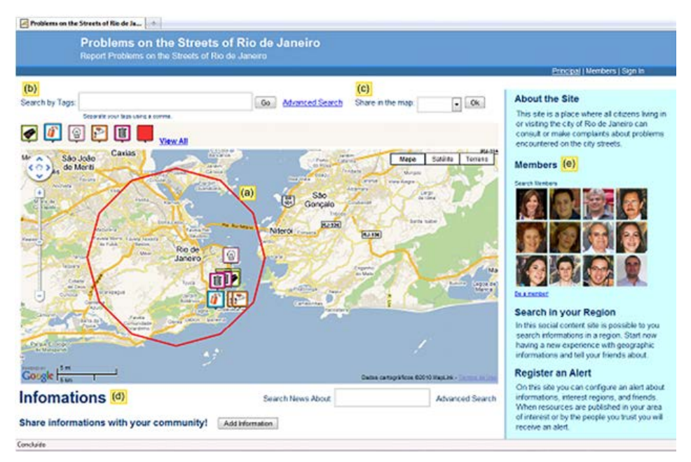
Figure 5. LBSN site created with the DYSCS platform.

For conducting advanced searches in sites created with DYSCS, users should access the advanced search interface. In this interface, users can configure several parameters in order to obtain the desired information. An user of the site 'Street problems in Rio de Janeiro' can search, for example, for the posts annotated with the semantic metadata 'Asphalt concrete' and with geographic metadata within a buffer of 2.5 km radius from the location named 'Copacabana Beach'. The results of this search are displayed in textual format and the ones among those associated with geographic metadata can be visualized in the map.