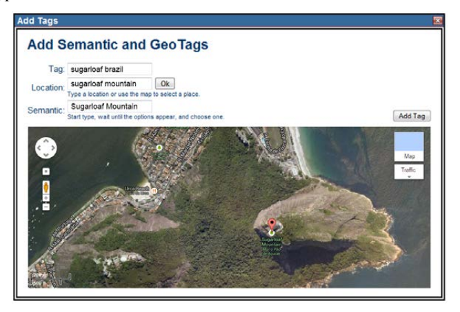
Figure 2. Interface for creating geotags, semantic tags, and the combination of both.

Figure 2 depicts the DYSCS interface that allows the assignment of semantic and geographic metadata. The text fields 'Location' and 'Semantic' use an auto-complete feature that displays the topics extracted from the Freebase database referring to the word typed in.