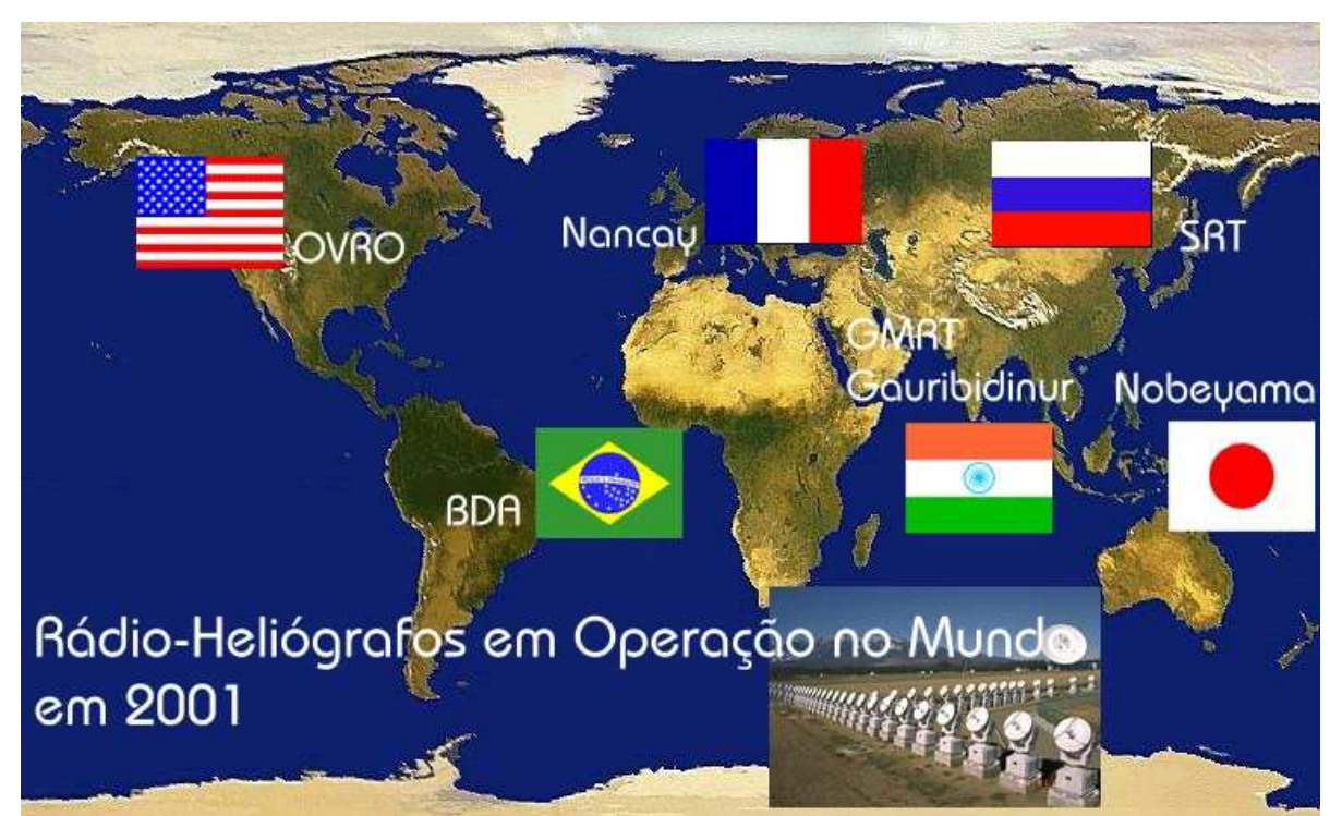
Fig. 1 – Distributions of solar radio telescope in the world showing the importance of the position of the location of the BDA for continuos solar activity monitoring

and 408 MHz and Gauribidnur Radioheligraph operating at 40 - 150 MHz (Subramanian et al., 1994, Ramesh et al., 1999). Combined observations of the active regions will lead to continuous investigations of the time evolution of the active regions at various altitudes. This is essential for predications of the solar activities and understanding of the fundamental problems in solar physics. Presently monitoring of the active region can be done by using is Radioheliographs of Japan, (Nobeyama), Siberia (Siberian Solar radio Telescope- SSRT-), India (Gauribidnur), France (Nancy) and that of the USA (OVRO). However there is lack of the continuity of the observations between Europe and USA. BDA will have common time between Europe and USA thus will fill this gap, in addition to that BDA will be unique solar radioheliograph in Southern Hemisphere as shown in Figure 1.