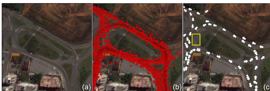
Figure 2. Second test: (a) satellite image; (b) points after preprocessing; (c) road centerlines with incorrectly mapped area highlighted

The second test showed in Figure 2 has been performed on a large roundabout that has access points to two universities and to various places of the city. From all test scenarios, this one is considered by the authors as the most complex because of: (i) roads with multiple lanes; (ii) proximity of the roads, with similar or different directions of movement.