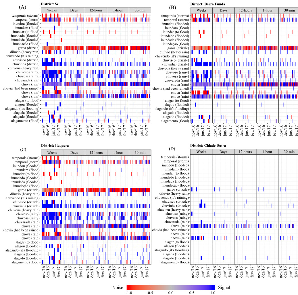
Figure 2. Hovmöller-based diagram depicting the signal and noise of the key-words over the entire period of analysis and across the four highlighted districts in Figure 1. The x and y axes show the time slices and the keywords, respectively. The blue color represents the signal intensity, whereas the red color represents the noise intensity. White color represents no data. The signal and noise were measured as the fraction between on-topic and off-topic tweets and all the tweets posted within the district (relative frequency) and, later, rescaled to [-1, 1].

Future work should further extend this exploratory content analysis by incorporating other cities in order to understand the noise of the rain- and flood-related keywords. Once the noises are understood, keywords can be selected to filter the social media messages more accurately. Finally, skip-gram models (e.g., word2vec) could be used to address the ambiguity problem of terms in social media.