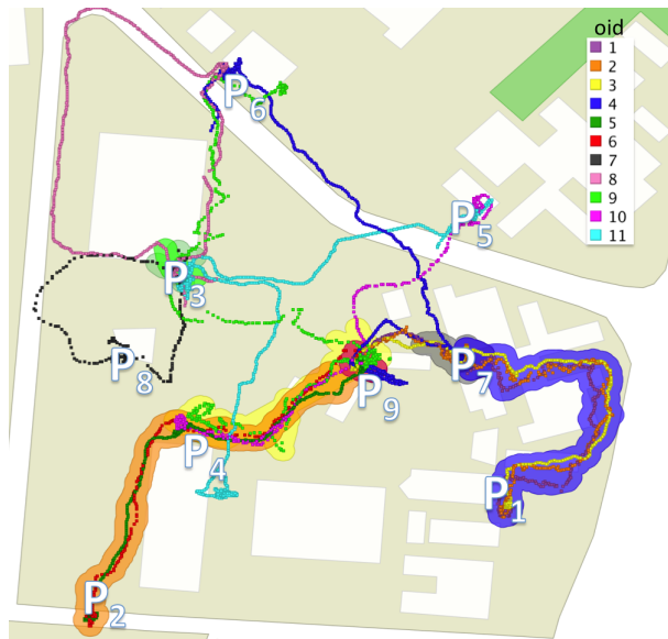
Figure 3. Trajectories and Encounters at UFSC